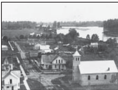
A historic view of Harrisburg