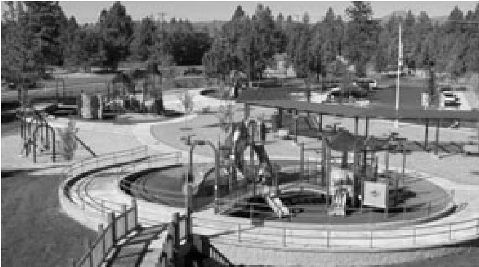
Larkspur Park, behind the Bend Senior Center

Osher Lifelong Learning Institute • UO Continuing Education • 1277 University of Oregon, Eugene, OR 97403-1277 (541) 346-0697 • ctrinfo@uoregon.edu • http://osher.uoregon.edu